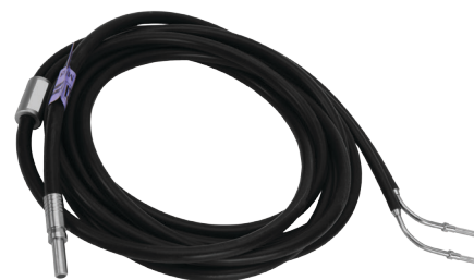
ML-0045 Phantom ML™ Light Cable w/ TeDan Connector -Reusable