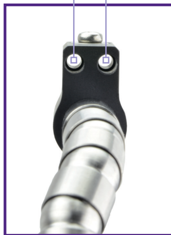
HS-0305 Phantom Flex Arm w/ Light Cable Holder