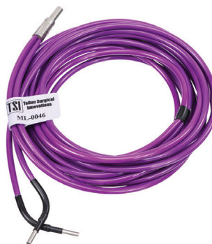
ML-0046 Phantom ML™ Light Cable w/ TeDan Connector -Sterile, Single Use Only