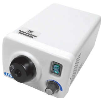
ML-0051 Phantom ML™ LED Light Source -Bright, 52-watt LED light source, cool light